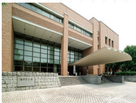
Media park RINPUKAN